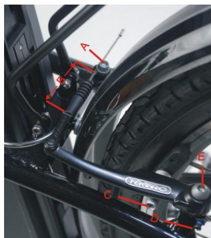
A-Cable clamp bolt B-No contact C-Pad fixing bolt D-Centering screw E-Arm fixing bolt

Adjustment for front and rear V brake: (Note picture shown is for rear brake only)