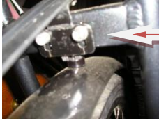
view from below of bracket and screws

Retighten the screws securely. (caution – do not remove all clearance as it will be difficult to remove the battery if this is done).